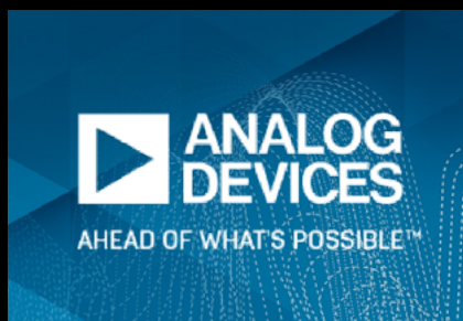
MERGING AND ANALOG DEVICES EMBEDDED AES67 SOLUTION ON THE POPULAR SHARC+® SOCS