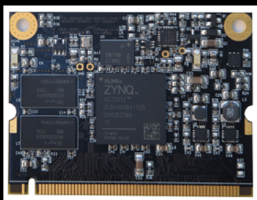
OEM BOARD FOR AES67/RAVENNA