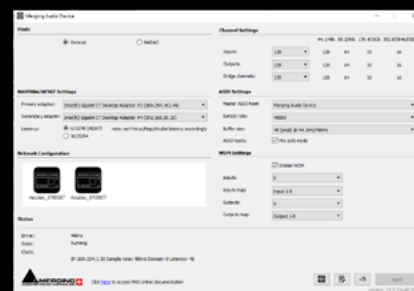
FOR MAC - CORE AUDIO, LINUX - ALSA, WINDOWS - ASIO/WDM

A small selection of companies around the world trusting our products as users, partners or both.